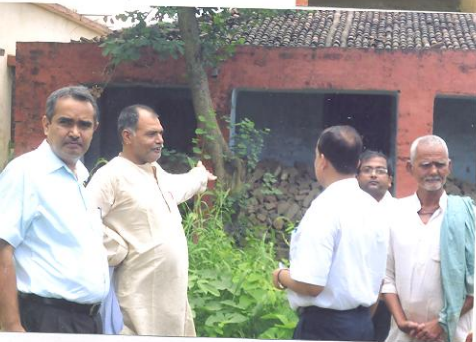
(7) विद्यालय का पुराना भवन ।