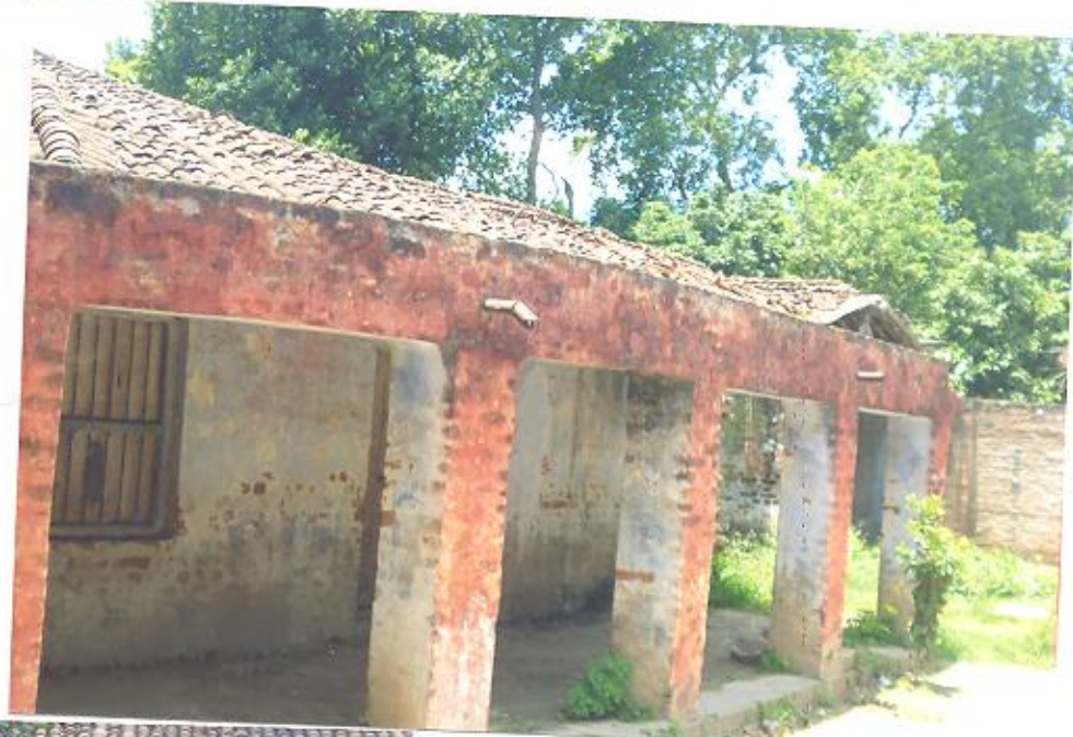
(6) विद्यालय का पुराना भवन ।