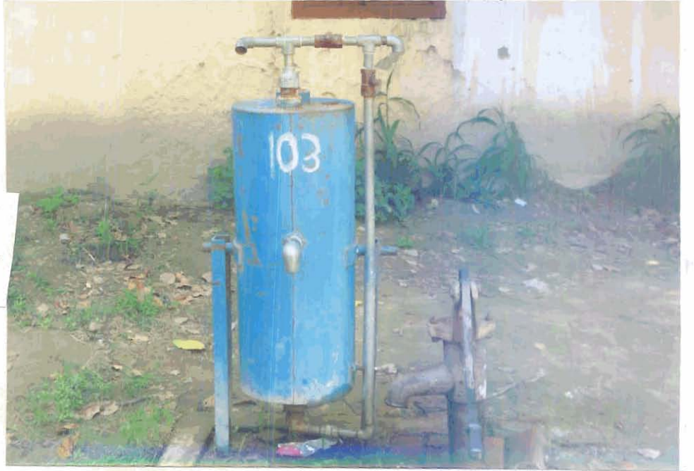
(4) चापाकल के पानी को टंकी में संचित कर उपयोग करना