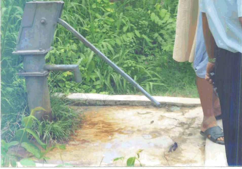
(3) चापाकल की दयनीय स्थिति ।

राजकीयकृत उच्च विद्यालय, नारेपुर, बछवाड़ा, जिला-बेगूसराय