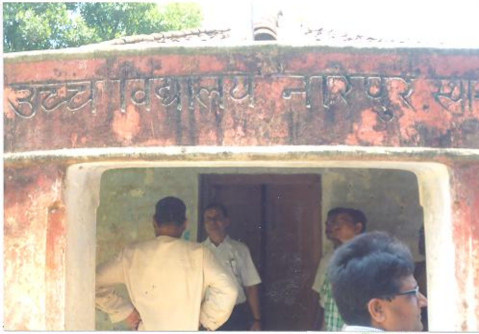
(5) विद्यालय का पुराना भवन ।